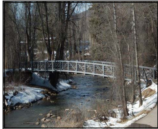
Nearby River & Trail Access

This elegant property is situated conveniently in town close to Clark's Market, the Post Office, and the Rio Grande Trail which meanders along the Roaring Fork River. The home is perfect for entertaining adults on the upper level where the living/dining/deck areas are, while the younger ones entertain themselves on the lower level. Separate spaces, comfortable furnishings, warm living—all awaits you at this special home-away-from-home.