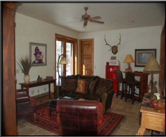
Downstairs Living Area