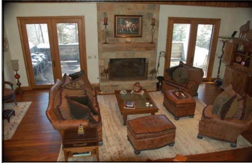
Miner's Trail Road